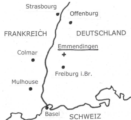
Location of Emmendingen in the border triangle

The most prominent recent events were the following: With support of the town's authorities a four-day " Charrette " (participatory workshop) took place in Emmendingen in February 2011. Emmendingen has 30,000 inhabitants, is ideally located north of Freiburg i.Br. in the border triangle Germany-France-Switzerland; an ideal location for the college. Most importantly, the local authorities and residents are extremely supportive of the project. During the Charrette, a number of experts helped to assess possible building sites, to discuss the renovation of existing or the construction of new buildings, to estimate costs involved, to investigate possible synergies for the region and to design a curriculum. Meanwhile a college promotion circle has been formed in Emmendingen to support COHE.