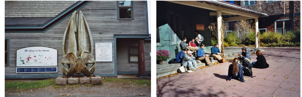
Prominent features of the COA curriculum are courses held with small groups in a seminar format, practical project orientation and community involvement. Nature experience also plays an important role.

Liberal arts colleges as well as study programs in human ecology are in Europe few and far between; the combination of liberal arts with human ecology is completely nonexistent. Yet we need such institutions urgently. Why?