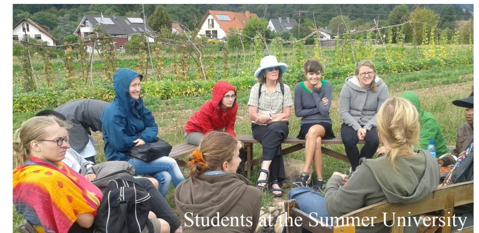
Students at the Summer University

Students will have ample time to gather first-hand experience on site with their partner business or organization, and work autonomously in teams to develop their projects. Experienced faculty members from both DGH and COA will work with the students to guide their learning, while respecting individual interests and creativity and encouraging students to self-organize.