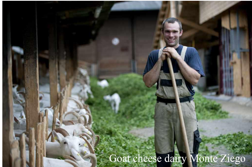
Goat cheese dairy Monte Ziego

German Society for Human Ecology (DGH) in cooperation with the College of the Atlantic (COA), USA